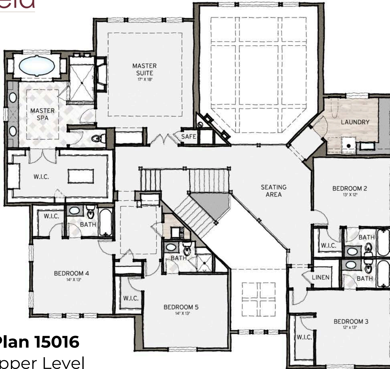
Plan 15016 Upper Level